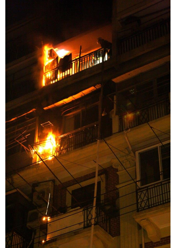
(*9) Fires started in apartment building balconies caused by errant fireworks.