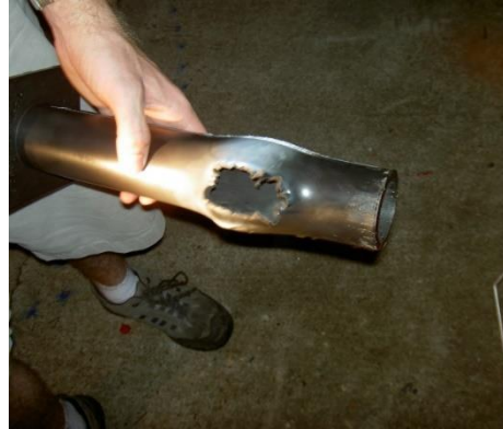
(*8) Firecracker that exploded out the side unexpectedly instead of out the top, almost causing serious injury and property damage.