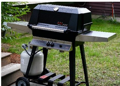
(*5) Gas Grill

Always do a safety check on a gas grill before using it for the next cookout. Make sure tubes aren't blocked, hoses aren't cracked and there are no gas leaks.