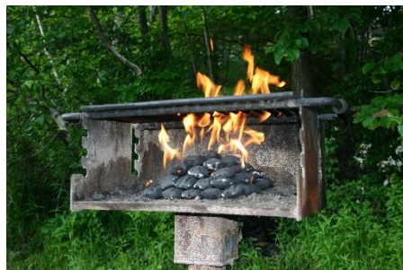
(*6) Charcoal Grill

Charcoal produces carbon monoxide (CO) when it is burned and every year people die or are injured as a result of CO fumes, which is colorless and odorless.